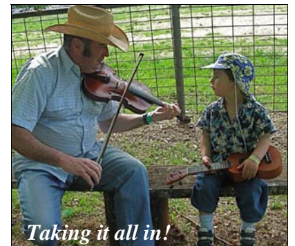
Taking it all in!