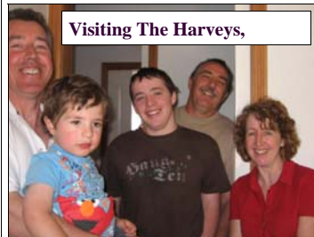
Visiting The Harveys,

WEBSITE NEWS:- More good news as we are finally making some changes and additions to the website which has remained stagnant for some time. It won't happen straight away but it will finally receiving some much needed attention over the next few months. Most importantly the Gig Guide will be being regularly updated - which is better for those wanting to know what gigs are happening, as well as a new section on 'Acoustic Shock' (including album details and sound samples), as they have been a big part of my Bluegrass experience and deserve some profile.