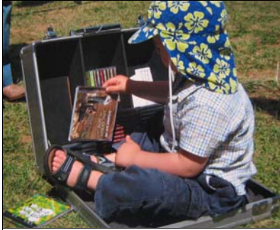
These gigs get pretty boring after a while, I guess there's always CDs to play with!