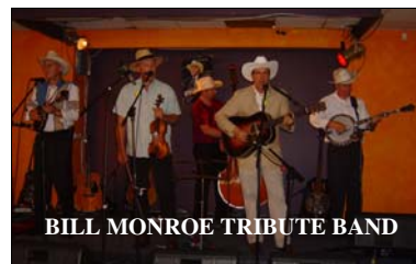
BILL MONROE TRIBUTE BAND