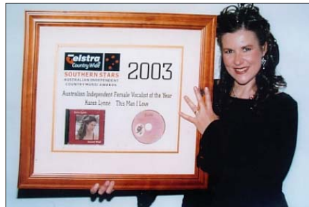
2003 Aust.Independent Female Vocalist Of the

sonnel to assist them in keeping up their career profile. This means unfortunately that Independent Artists will always be at a disadvantage when competing,.. still I persevere!