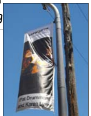
Tamworth Street Banner

Thanks for those who took some of my office giveaways,... it was such a waste to trash them all. Now it's my turn to ask!... anyone got a VHS Video player in working order that they don't want?... if so, I would be happy to take it off your hands!