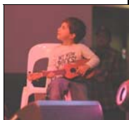
William in the wings, National Folk Fest.