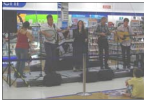
ABC In Store, Tamworth