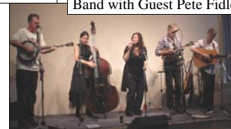
Blue Mountain Rain, Tamworth