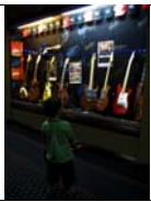
Will dreams, All those Guitars!!!