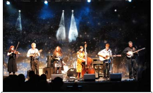
Blue Mountain Rain - National Folk Festival

EMAIL ME. It took a number of weeks to get the computer back on line (lucky I had a laptop which still ran 'dial-up' to get my email - which mind you, took ages & cost me a fortune!), but I was unable to use it for work on a normal daily basis. Within 2 days of getting that finally sorted & back on line, my modem was nuked and wasn't replaced for nearly 4 weeks due to two Telstra incompetents who didn't seem to know how to order a new one for me!... (how hard could it be to take my money?)... third time lucky, thank goodness! Anyway... if I haven't replied to your email or sent you what you've asked for,... please email me again!