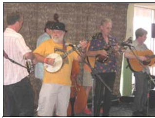
Illawarra Festival Jam