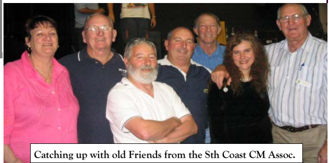
Catching up with old Friends from the Sth Coast CM Assoc.

SCCMA SERVICE AWARD - Thankyou to those in the South Coast CM Assoc. for the Club 'Service Award' presented to me at the recent Festival,.. it was a real surprise & a great honour! I grew up in this CM Association,.. & after many years of performing in shows, serving on committee & even putting together their 30 year History! it was really special to have it recognised, Thankyou!