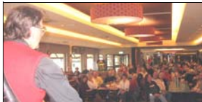
Nelson Bay (Blue Water Fest) Gig