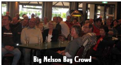
Big Nelson Bay Crowd