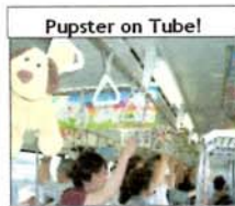
Pupster on Tube!