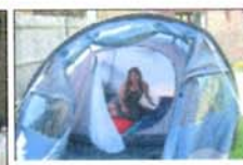
Bluegrass Free Zone