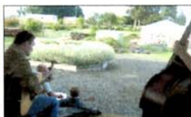
'Pickin' on Shirleys Porch, Tas