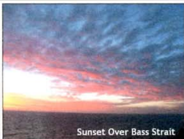
Sunset Over Bass Strait