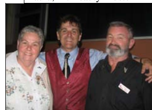
Greater Southern CM Club gig