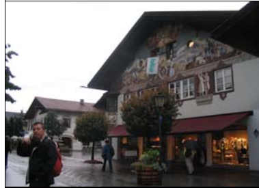
Village Murals, Garmish-Parten Kircken