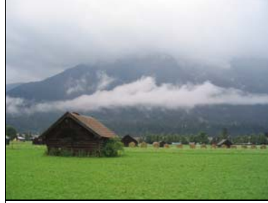
Bavarian Alps - Picture postcard views even on a misty day!